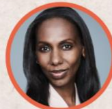
Nima Elbagir Senior Correspondent CNN