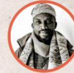
Jelili Atiku Pioneer of Contemporary Performance