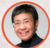
Maria Ressa Founder and Editor-in-Chief Rappler