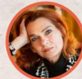
Aslı Erdoğan Author Human Rights Activist

*Interpretation in French and Arabic available