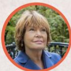
Yvonne Zonderop Commissioner Dutch UNESCO Commission